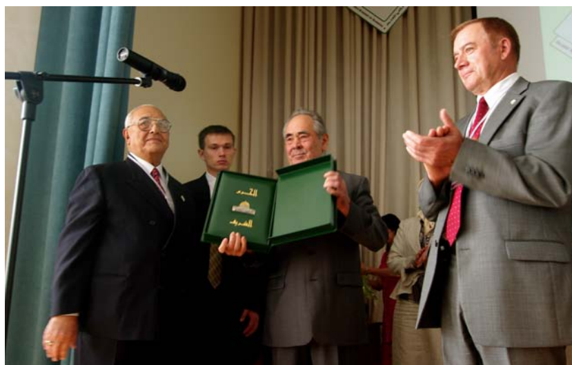
President of Tatarstan receiving his certificate of IAS Honorary Fellowship; 16 th IAS Conference, Kazan (Russia); August 2008.