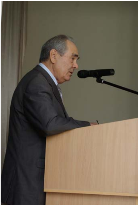
H E Mintimer Shaimiev President of the Republic of Tatarstan

In his opening speech, Mr Shaimiev talked about the history of the Tatar people and how they became Muslims. He emphasized that Tatarstan was gradually placing itself as a bridge between the Islamic world and Russia, which itself became an OIC-observer member in 2005.