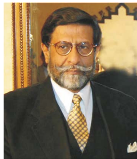
H E Mr Mohammadmian Soomro President, Islamic Republic of Pakistan Founding Patron Islamic World Academy of Sciences

I sincerely wish you successful work, good health and prosperity.