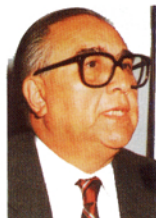
Prof. Abdel Salam Majali President (Jordan)

Prof. Majali was born in 1925. A Professor of Medicine, since 1972. Prof. Majali is a former Prime Minister of Jordan. He was also president of the University of Jordan for about fourteen years. He is a Founding Fellow of the IAS.