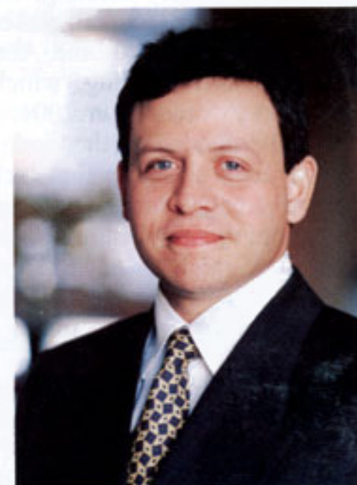
King lays cornerstone for the SESAME Project