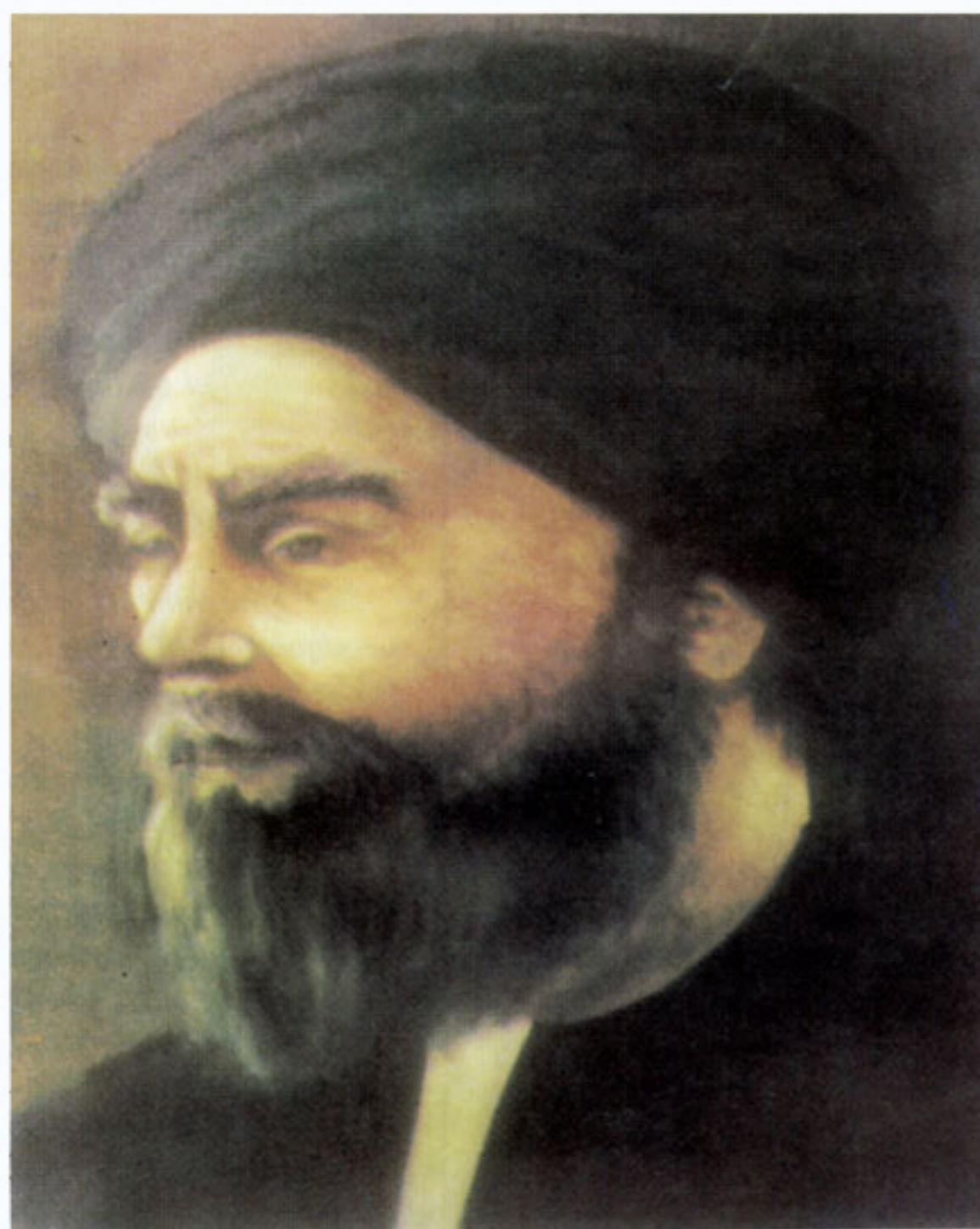
IBN AL-NAFIS (1213-1288 AD)